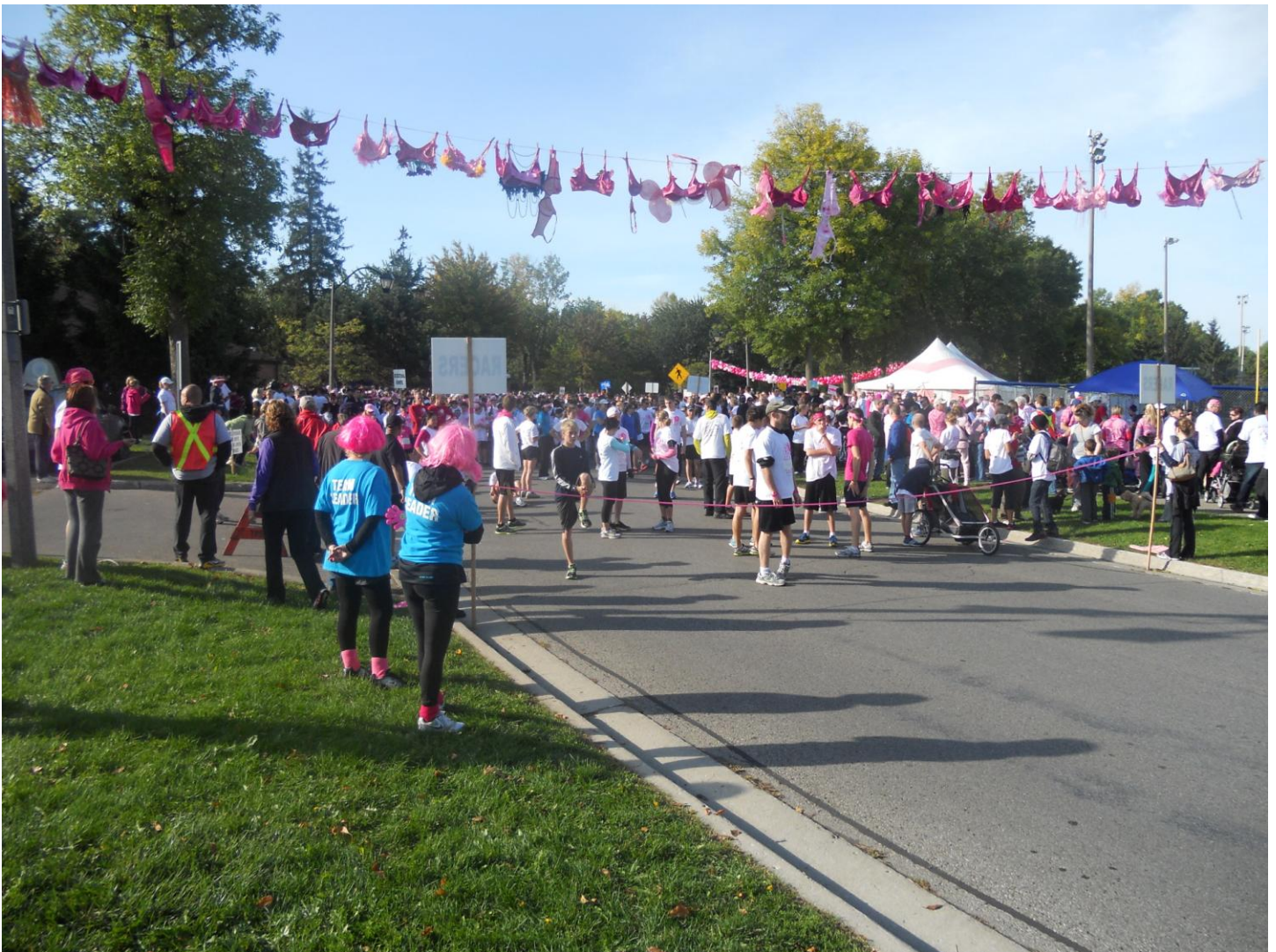
This was the start finish line

There may be some who think that this hobby is dull and boring or that there is no opportunity to do new things or interact with the community.... Take a look at this.