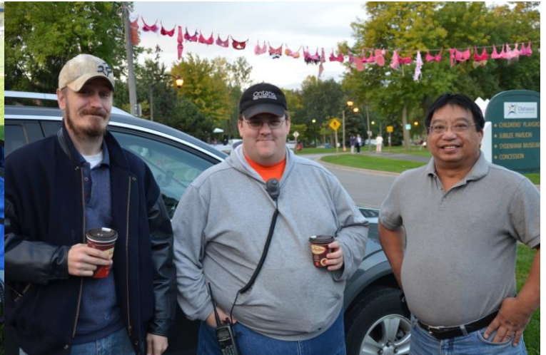
Some of the crew.