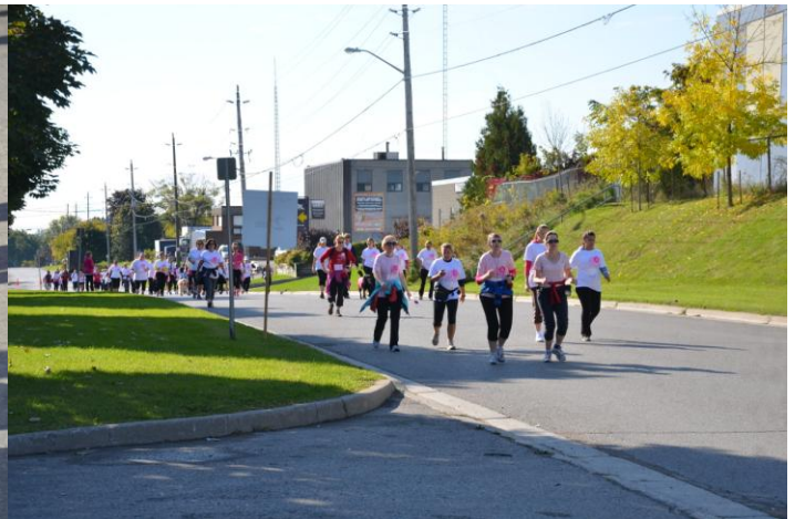
Some of the participants

This is an ideal practice for public support should we be called in an urgent or emergency situation. This is also a great way to get out in the fresh air and show what we can do. A new Club Member might be there waiting to have a chat.