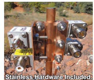
Stainless Hardware Included.

For direct attachment of Alpha Delta Model ATT/TT3G50 series broadband coax surge protectors to your ground rod. P/N UCGC $64.95