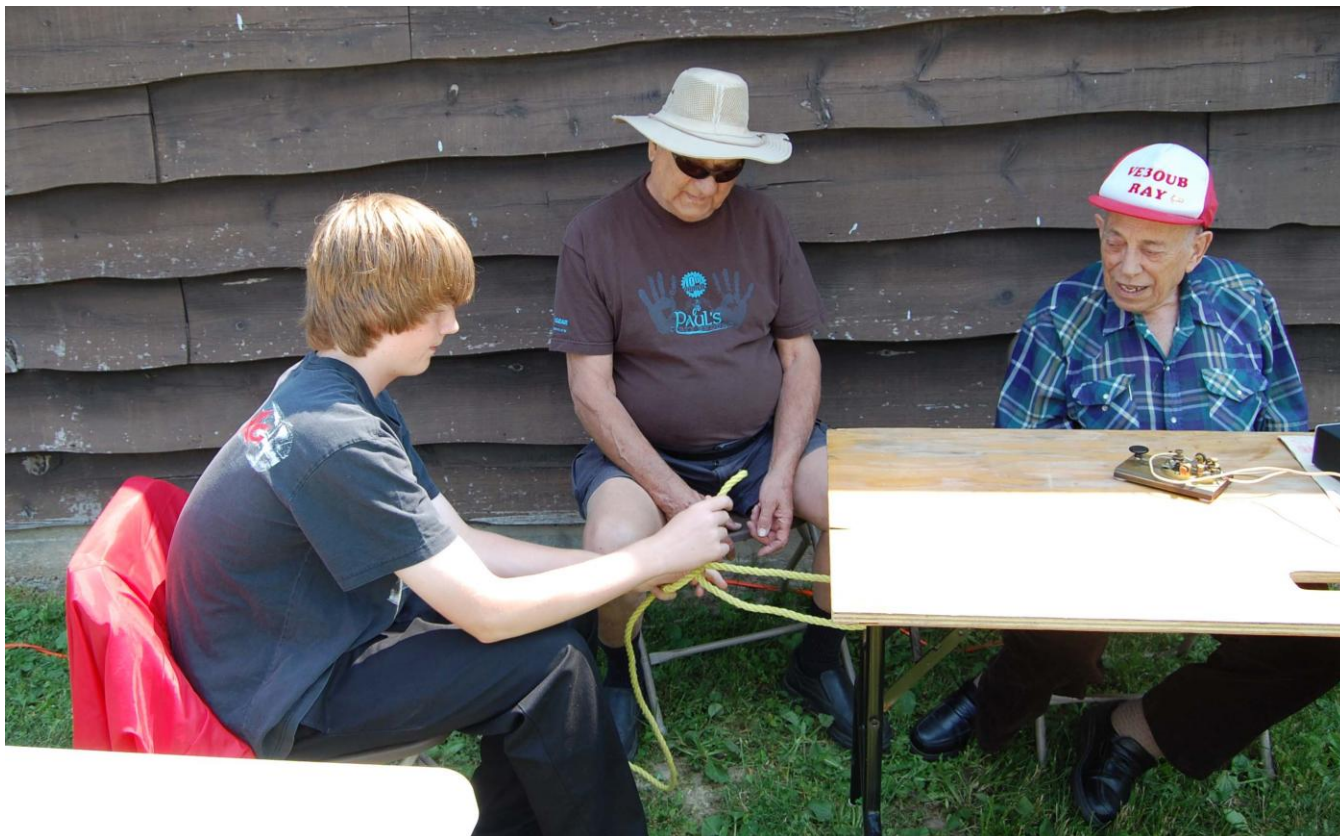
Come on out and learn the ropes (Ed.)

Teardown will start at 1400 EST on Sunday June 27 th ; however, call on the repeater before hand in case teardown starts earlier on the Sunday.