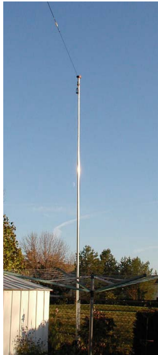
The "good" mast.....

I've enjoyed the warm weather. I'm still not sure about spring in December. Nor am I all that happy with spring in January. After all this is Canada. We're supposed to have 4 seasons. I'm concerned that because there is only so much warmth or cold allocated to a given year, we might end up with a cold dry summer or worse yet a cold wet summer. Any way this is great weather for antenna work. My 20-foot piece of aluminum pipe is up at the back of the yard. That's the "good" mast. It has 2 internal halyards and the pulleys work really well as long as there is sufficient load on the lines. It replaced the "old" mast that topped out at 10 feet and wasn't really helping matters much. Of course the aluminum siding on the house is what started the whole mast thing to begin with. It's amazing how much siding can mess up a match. At least it is to me. The change in my 20M results was most pleasing. I showed my wife the new and improved mast. Her comment was that it was an eyesore "just like the other one". The old mast was retired to the garage until it was rejuvenated as the "bad" mast that is temporarily holding up the other end of my 50 foot long wire as well as my 2M J-pole.