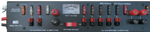
Fig. 1. The MFJ-1129 features both switched and unswitched Powerpole and binding post connections.

Figure 1 shows the MFJ-1129, a versatile DC outlet strip.